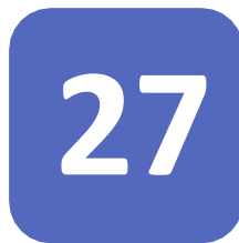
Regional Hospitals and Community Clinics