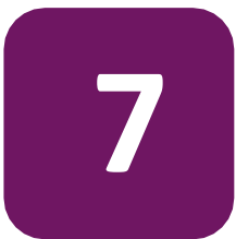
Large and Specialty Hospitals